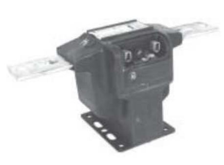
JKM-0 Current Transformer

(approximate, in pounds) Transformer ......19/16