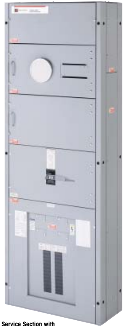
Service Section with Main Fused Switch and Distribution Panelboard