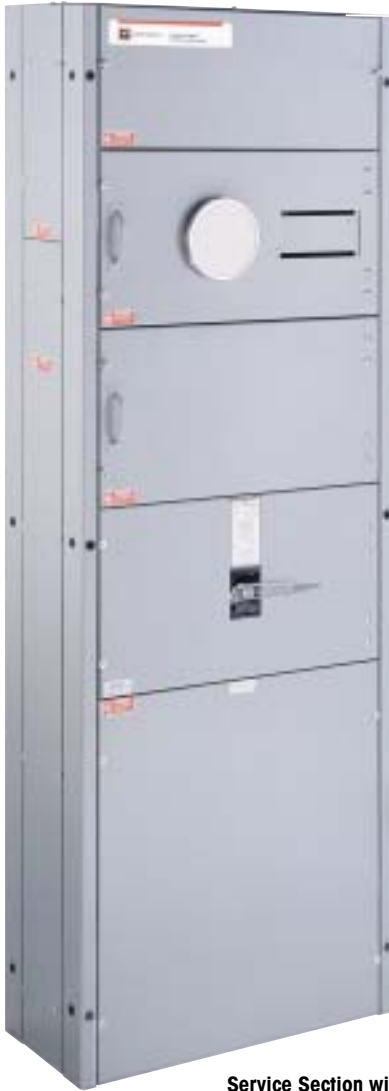
Service Section with Main Fused Switch Only