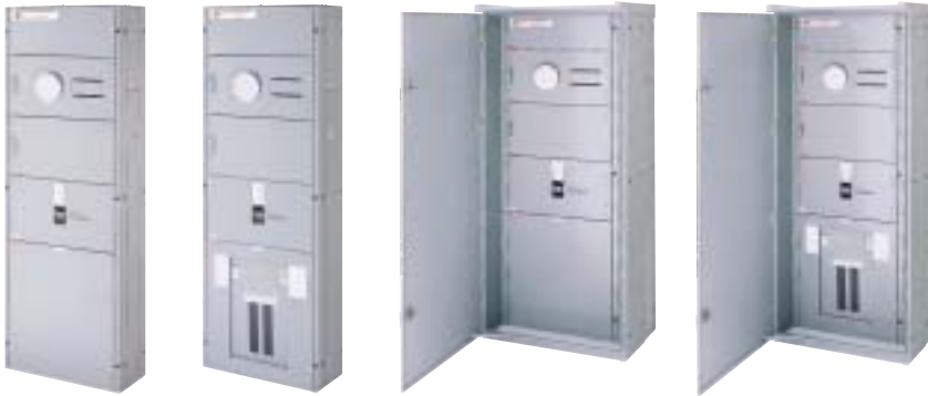
NEMA 1 Indoor NEMA 1 Indoor NEMA 3R Outdoor NEMA 3R Outdoor