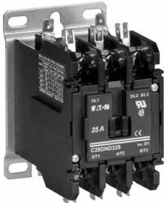
15–360A, Two-, Three- and Four-Pole—C25