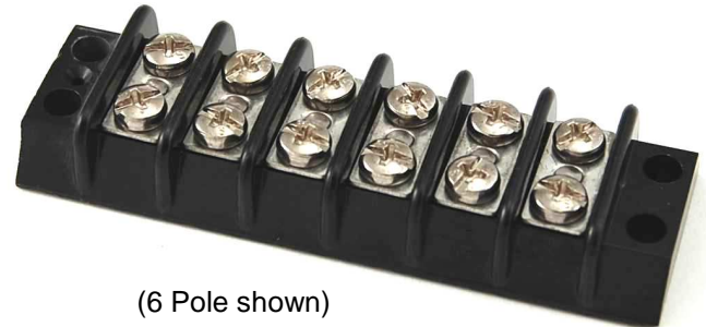
(6 Pole shown)